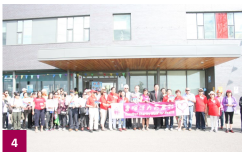
4 Carefirst Board Directors and officiating guests leading the Carefirst Charity Walk for Health.