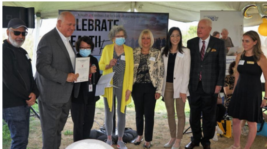
▲ Opening Ceremony

On Saturday September 17, 2022, Carefirst, Eastern York Region North Durham Ontario Health Team, and South Markham High Priority Communities Program Service (HPCS) Partners successfully hosted the Celebrate Health Fest at Markham YMCA.