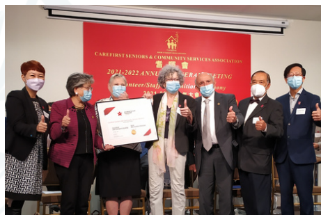
Presentation of the Accreditation Certificate

Carefirst values seeking accreditation as a means to fulfill our commitment and support ongoing improvements to client care and safety across the organization. Accreditation helps to create better health care and social services, allowing organizations like Carefirst understand how to make better use of resources, increase efficiency, enhance quality and safety, and reduce risk.