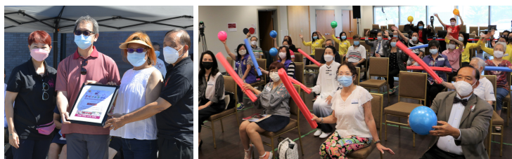
▲ Event Sponsor: J&J Family

On August 13, 2022 over 300 community members of all ages energetically came together for the in-person Charity Walk & Seniors Active Living Fair in partnership with The Older Adult Centres' Association of Ontario and sponsored by the Ministry for Seniors and Accessibility. It was a day filled with information booths, fun activities, exercising, performances and delicious food to enjoy staying healthy and active together.