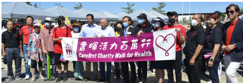
▲ Charity Walk Opening Ceremony

Carefirst Foundation successfully held its 10th annual Charity Walk for Health "Active in Summer" Challenge July 15 to August 31, 2022. A 6-week hybrid activity campaign of personal goal setting exercise activities, staying active and healthy. All proceeds raised from the Carefirst "Active in Summer" Challenge will support the development of our exciting Capital Campaign project, Carefirst Campus of Care located at 9893 Leslie Street, Richmond Hill. The community actively participated in coming together to safely getting back up and moving with friends and family while raising funds and being part of something that has a positive impact.