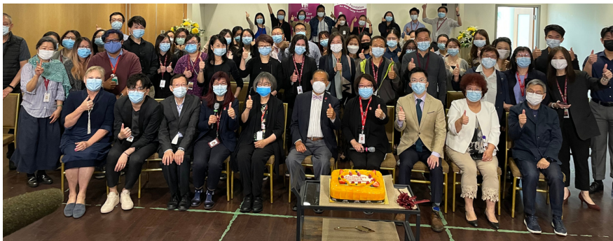
Carefirst Board, Staff and Volunteers at Accreditation Debriefing Session & Celebration

From June 6 to June 9, 2022, the Accreditation site survey took place. Carefirst Seniors & Community Services Association conducted its sixth accreditation cycle in a “hybrid” model consisting of a virtual and on-site surveyor with Accreditation Canada. Accreditation Canada is an international, not-for-profit organization offering accreditation specifically tailored to community-based health and social service agencies.