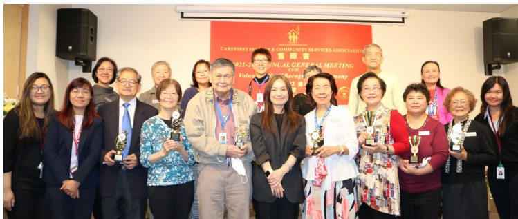
▲ Long-service Volunteer Awards