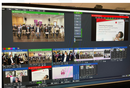
Accreditation Debriefing Session

“You have demonstrated the ongoing commitment to act and not be satisfied with the status quo... you walk the talk in applying the Total Quality Management Framework and INTEGRATE Program... this is a national model you can be proud of.”