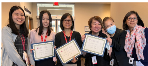
Home Care Department Staff Recognition Awards

We greatly appreciate the hard work and dedicated effort from our board, staff and volunteer members in moving our business and services forward. Over 150 members, staff and volunteers were awarded for their long-term service at the Staff/Volunteer Recognition Ceremony.