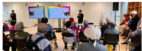
▲ Celebrate Health Fest Workshops

Look forward to more upcoming activities! Please contact our HPCS Team at 416-646-5108 for more workshops and information.