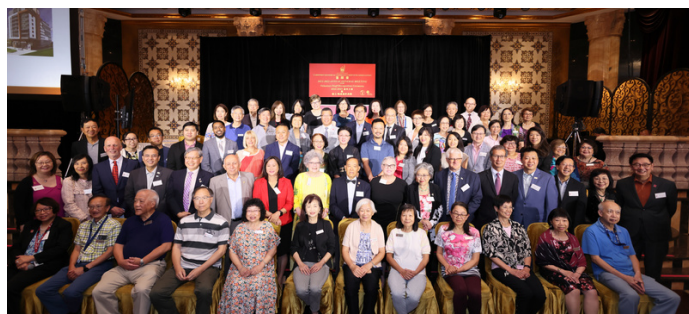
▲ Dignitaries, Board Members and Long-service Volunteers

We greatly appreciate the hard work and dedicated effort from our board, staff and volunteer members in moving our business and services forward to meet the needs of our clients and community. Over 120 board members, staff and volunteers were awarded and recognized for their long-service.