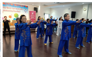
▲ Performance by Lucky4U