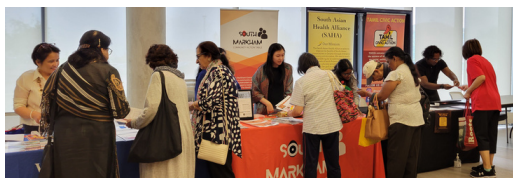
▲ Booths from our community partners