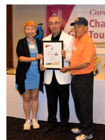
Title Sponsor ▲ Representative

Please mark your calendar for 2024 Charity Golf Tournament: June 25, 2024