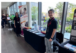
▲ Service and information booths