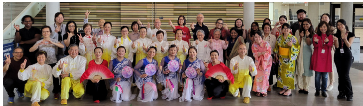
▲ Staff, partners and performers at the Together We Celebrate event

Carefirst was privileged to have volunteer instructors and students, and community partners representing different cultures to participate in putting on performances, and information and activity booths. A sincere thank you to Aaniin Community Centre & Library for their enthusiastic collaboration in helping us host a fun day celebrating the unique and diverse cultures that make our communities special!