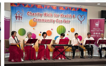
▲ Performance by CCHG