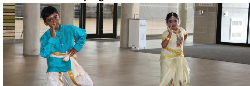
▲ Tamil dance by students of Kalikovil Academy of Fine Arts

Huge thank you to all performers for putting on a spectacular show!