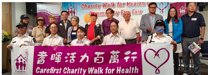
▲ Charity Walk Opening Ceremony

Thank you to the community for your support – we have raised over $125,000 this year! All proceeds raised will support the development of our exciting Carefirst Campus of Care project to be located at 9893 Leslie Street, Richmond Hill. Special shoutout to all the wonderful participants, donors, sponsors, volunteers, wellness program instructors, performers, community members, partners and staff for supporting Carefirst, and making this event possible and a huge success. Every step we take brings us closer to a healthier community.