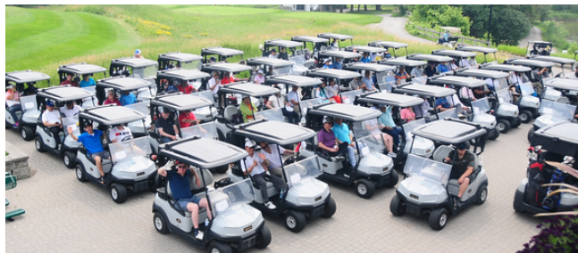
▲ Golf Tournament participants are ready for a friendly match