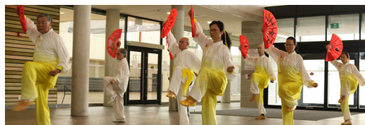
▲ Tai Chi and Qigong demonstration by Carefirst Wellness Club program instructors and students