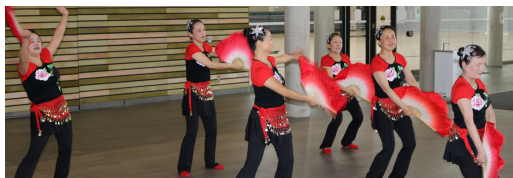
▲ Chinese fan dance by Carefirst volunteers Jing Dance Group