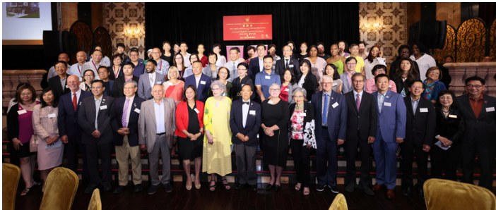
▲ Dignitaries, Board Members and Long-service Staff