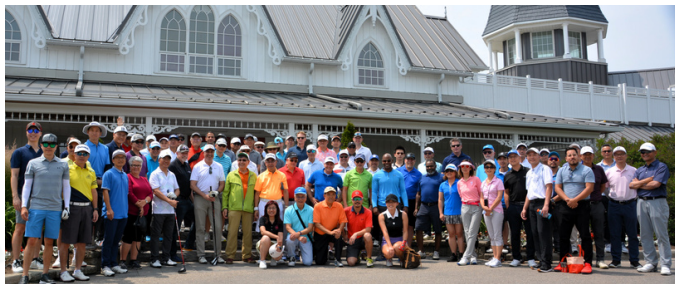
▲ Thank you to all sponsors and golfers for your support and participation